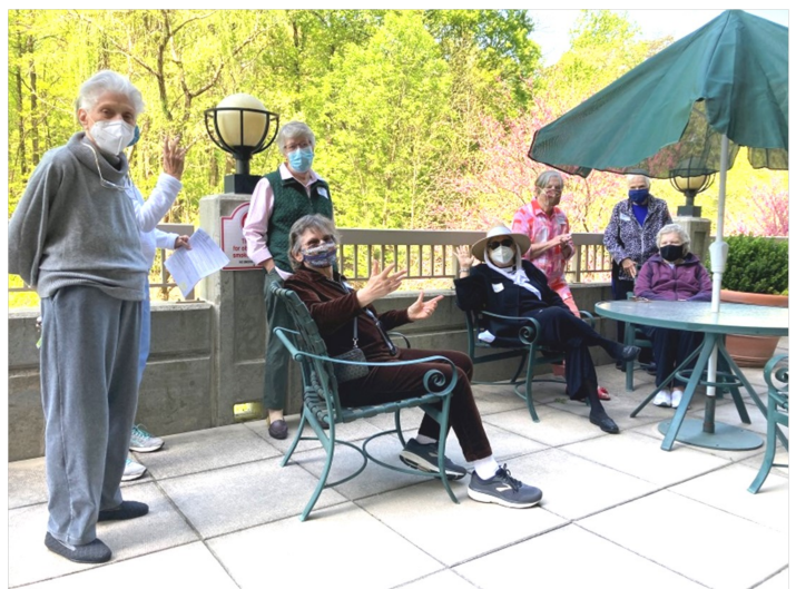
Come Chat participants on the terrace on April 27

—Barbara Eisen for the Activities Committee