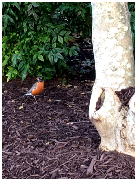
This robin decided to spend the spring in Leisure World!