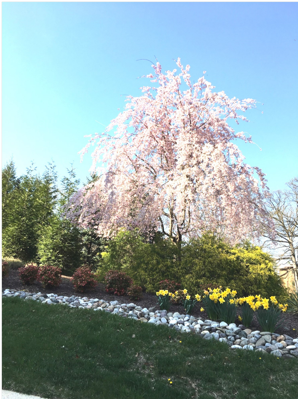
Weeping Cherry on the berm

Your VPE Board has been asked a few times, when are we going to open the Community Room? At this moment it is difficult to tell. If you listen to the news, read a newspaper, or listen to the CDC, the advice changes from week to week on what we should do and who is right or wrong as to community